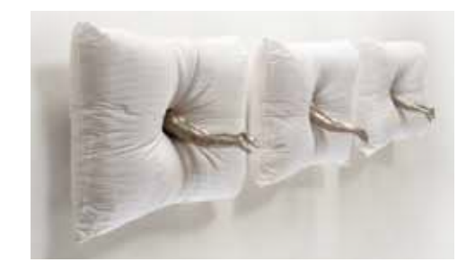
Joël Boudreau. Une visite chez Orphée, 2008 / Visiting Orpheus, 2008

Using everyday objects and sculptural figures, the artist constructs a story about an idea. Conceptual artists work out their concept or idea in whatever materials and forms are appropriate, giving the idea or concept more importance than the materials. Idea: Explore what the artist means in this work: create an artwork from an idea.