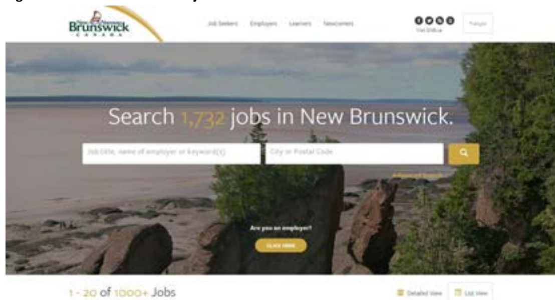
Figure 1: Screenshot of new nbjobs.ca website

The analytics coming from the jobs on the website and its usage will also feed valuable labour market information to help calibrate training and other workforce development efforts in the years ahead (see Section 6 below).