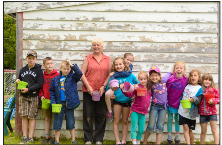
Children gardening at the Explore Your World After School Program in New Maryland, NB.