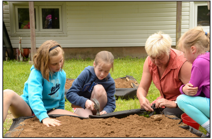
Children gardening at the Explore Your World After School Program in New Maryland, NB.