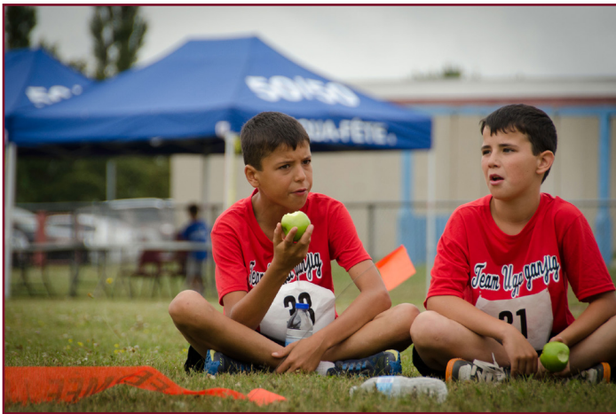
Children enjoying a healthy snack at the 2014 New Brunswick Indian Summer Games in Burnt Church, NB.