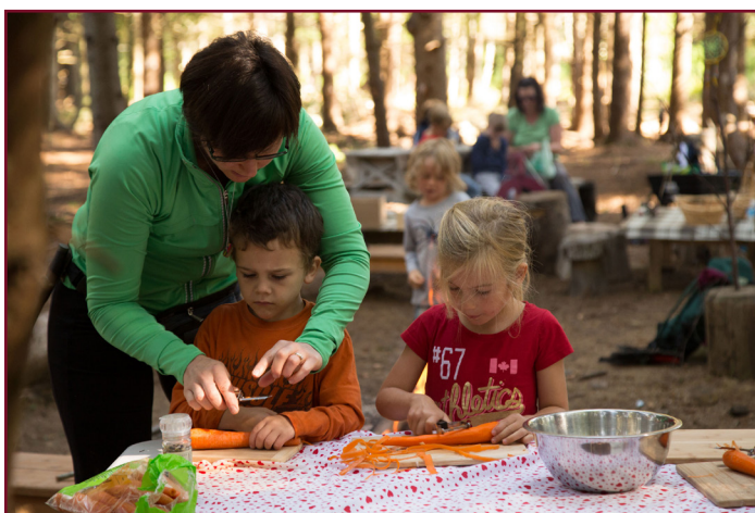
Children preparing lunch at Tir na nÓg Forest School in Roachville, NB.