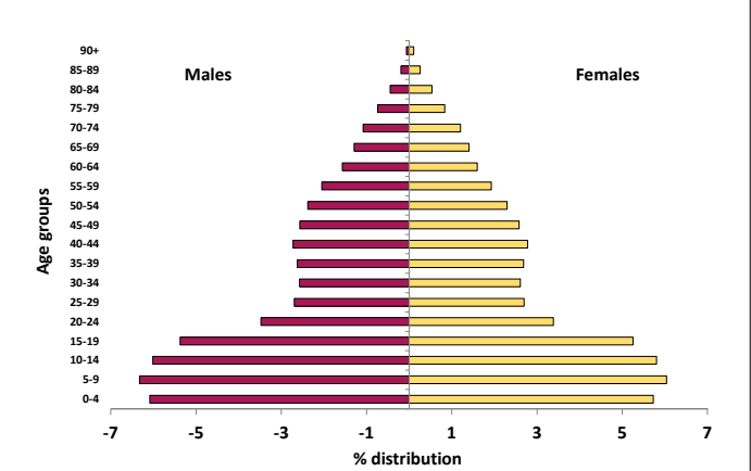
Age distribution, N.B., 1966