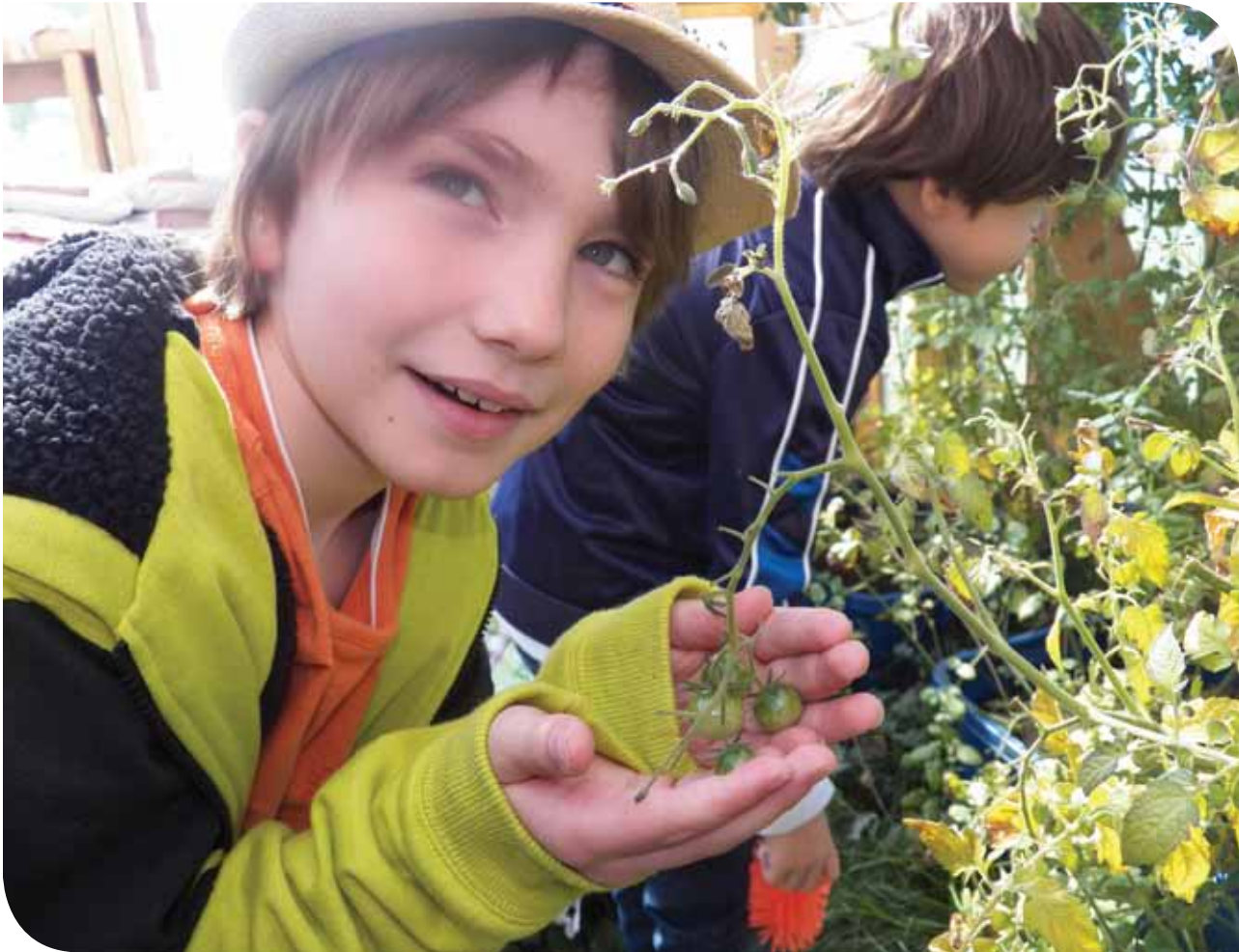
FRANCOPHONE NORD-EST SCHOOL DISTRICT

School-community project, François-Xavier-Daigle school, Allardville, N.B.