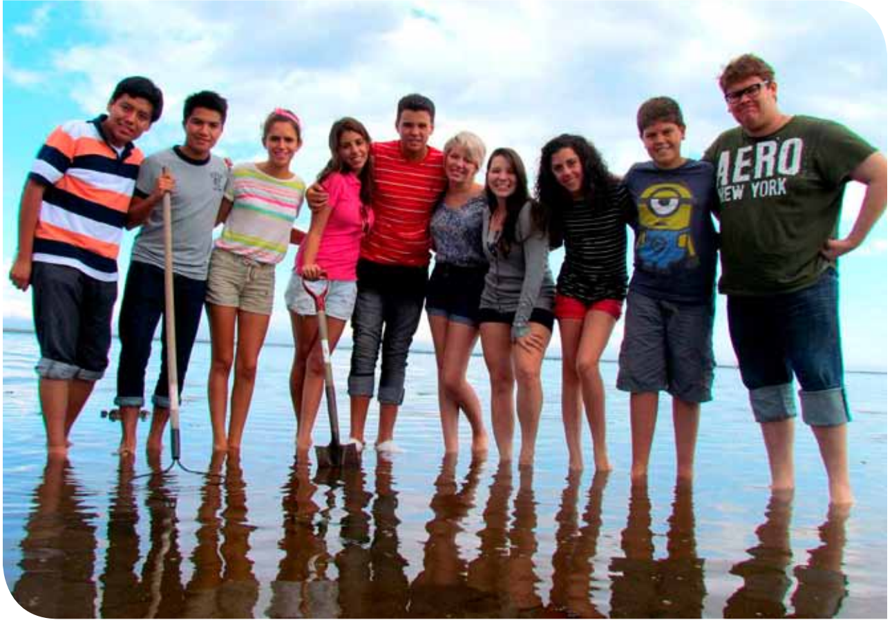
International students clam fishing (immersion camp).

International education initiatives are already under way in the Francophone sector. Existing activities should receive more support, and steps should be taken to develop those components that are missing or incomplete in order to increase and broaden opportunities for educational experiences that open up windows on other cultures and can export local know-how. Establishing multi-sector strategic partnerships (public and private sector) and developing and implementing an innovative business model are essential if we are to take full advantage of the opportunities inherent to international education.