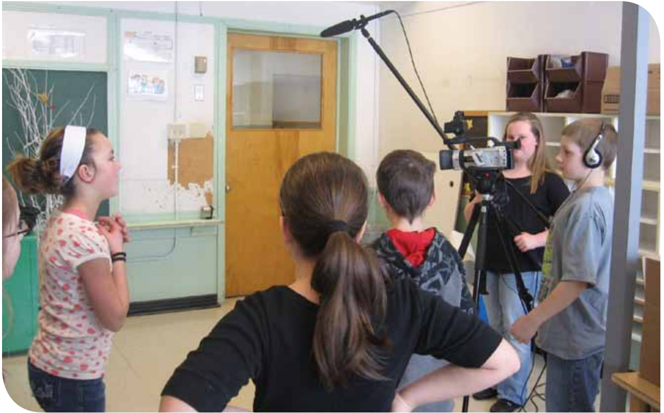
FRANCOPHONE NORD-OUEST SCHOOL DISTRICT

Students leaving secondary education without a strong foundation may experience difficulty accessing the postsecondary education system and the labour market, and they may benefit less when learning opportunities are presented later in life. Without the tools needed to be effective learners throughout their lives, these individuals with limited skills risk economic and social marginalization.