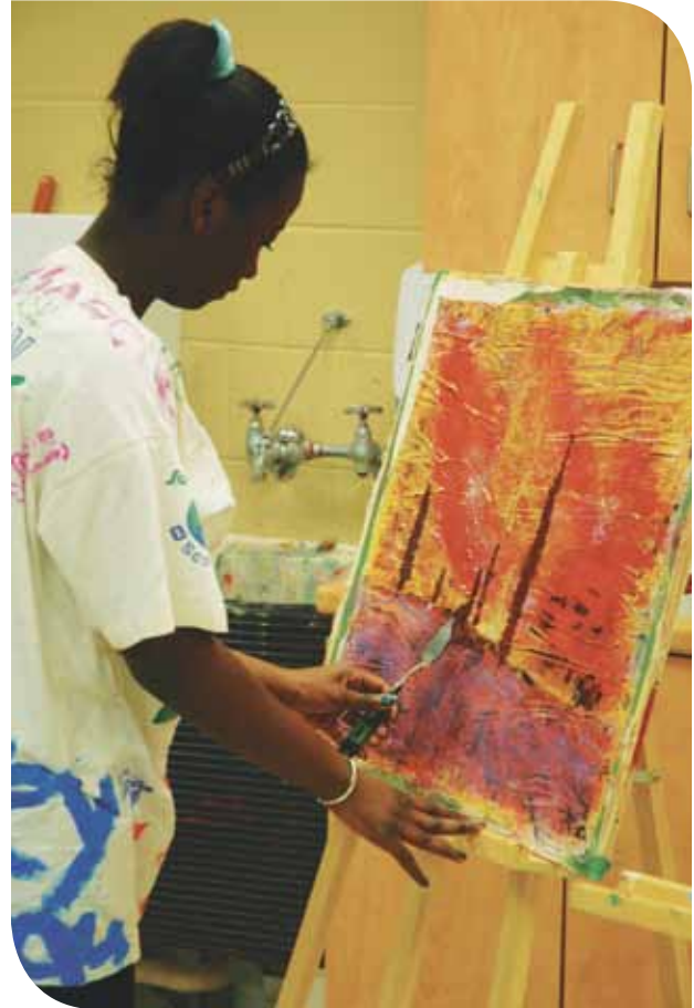
FRANCOPHONE SUD SCHOOL DISTRICT

in the educational success and identity building of their child. This awareness raising must be followed by concrete actions that can kindle parental engagement and collaboration among all the key stakeholders.