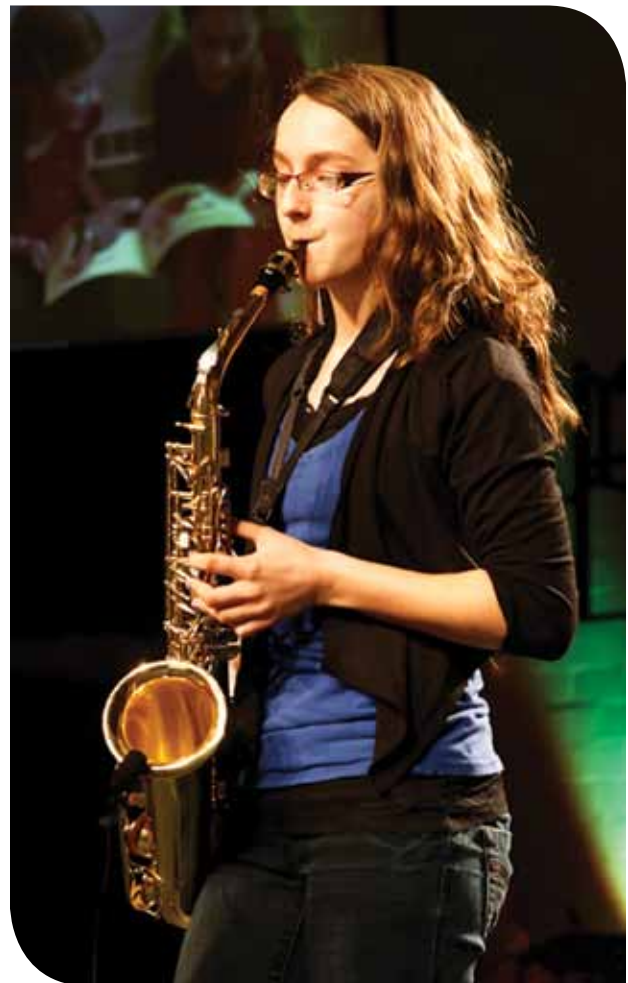
FRANCOPHONE NORD-EST SCHOOL DISTRICT.

In summary, the individual and collective commitment of all the education partners and the various sectors of society, together with the establishment of mechanisms of interdepartmental, intersectoral and community coordination and cooperation, will surely contribute to the creation of a vibrant Francophone space which, for individual and community alike, promotes the building of linguistic and cultural identity, the confidence and desire to express and affirm oneself in French, and participation in the growth of Acadian and Francophone culture and society.