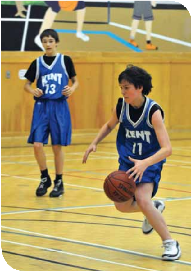
Jeux de l'Acadie.

It is interesting to note that the Strengthening Inclusion, Strengthening Schools report, published in June 2012, shows that responsibility for inclusive education lies with all academic stakeholders and cannot be successful unless leadership is assumed at all levels of the education system, collaborative structures are clearly defined, and initial and ongoing training is provided for all workers.