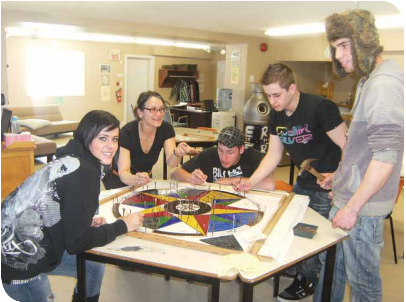
FRANCOPHONE NORD-OUEST SCHOOL DISTRICT