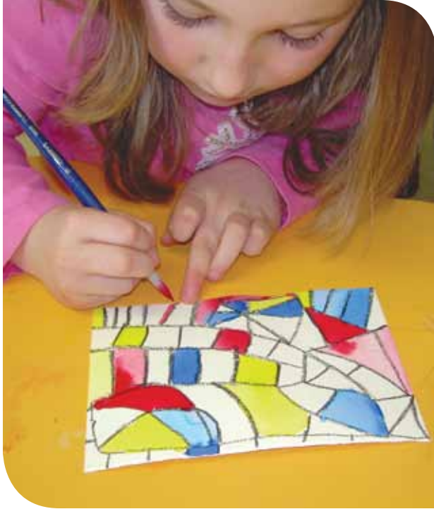
FRANCOPHONE SUD SCHOOL DISTRICT

Given all of these realities and requirements, it seems entirely logical to favour resources that have been or will be produced expressly for Acadian and Francophone youth. That being said, it may still be relevant to use resources from elsewhere, provided they are adapted to the Acadian and Francophone context, thus making it easier to truly meet the learners' needs and contribute to their identity building.