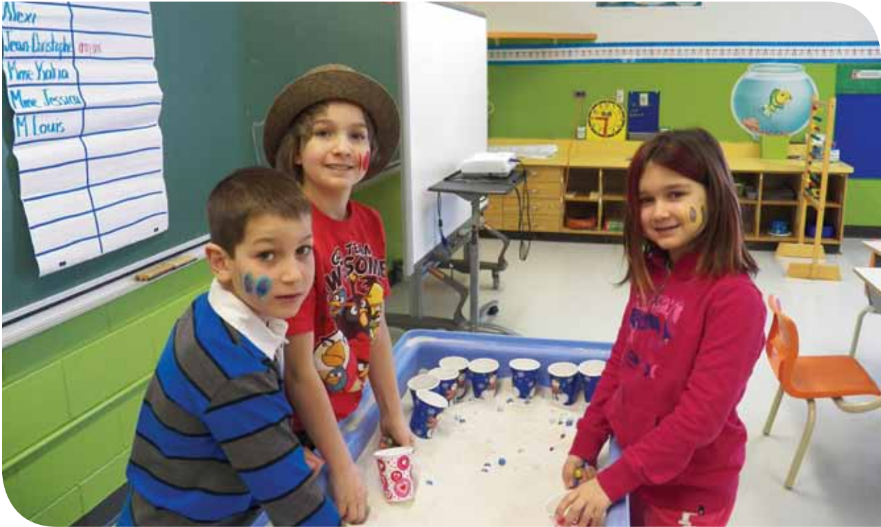
FRANCOPHONE NORD-EST SCHOOL DISTRICT