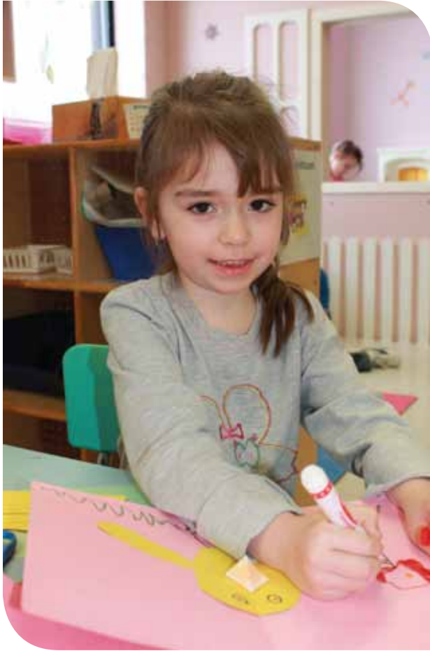
FRANCOPHONE NORD-EST SCHOOL DISTRICT

The government must adopt policies and structures to manage the delivery of these services properly in each linguistic sector. This dualistic approach to the management of early childhood services ensures and safeguards the fundamental elements of the province's linguistic and cultural character, and takes into consideration the actions required for the vitality of the official-language minority communities under sections 16 and 23 of the Canadian Charter of Rights and Freedoms by guaranteeing services in French.