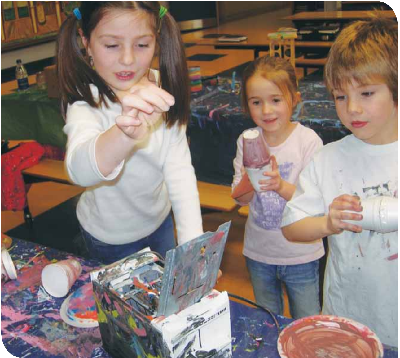
FRANCOPHONE NORD-EST SCHOOL DISTRICT

To ensure a greater number of resources featuring local cultural referents, it is vital to develop partnerships between the various early childhood service providers and agencies with an artistic, cultural, heritage or other relevant mission. It is a good idea to work together on targeting early childhood needs, and then to produce and provide access to quality French-language