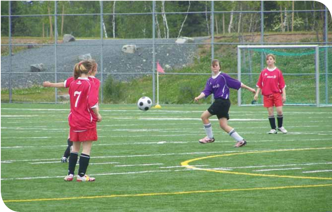
Jeux de l'Acadie.

in achieving common goals. It is also important to create a harmonious, friendly atmosphere that nourishes feelings of equality, mutual trust, attachment, competency, and autonomy. In the same vein, partnerships are cultivated through effective, open, and transparent communication. They are also cultivated through individual and collective accountability and participation in decision making, based on a shared vision and values, as well as on a common understanding of the issues. Last of all, the development of school-family-community relations requires considerable adaptability on the part of educational institutions, particularly through the introduction of mechanisms that promote integration and participation (e.g., planning meeting times and places that are convenient for the various partners).