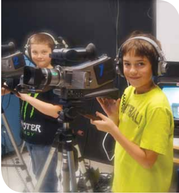
FRANCOPHONE NORD-OUEST SCHOOL DISTRICT

Envol program, Centre d'apprentissage du Haut-Madawaska, Clair, N.B.