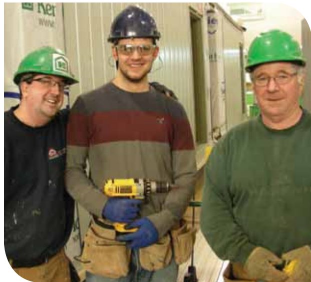
FRANCOPHONE SUD SCHOOL DISTRICT

There is no doubt that opening up to and initiating real collaboration with the community will make Acadian and Francophone schools even stronger. It is vital for the survival and renewal of Acadian and Francophone society to set up a constructive dialogue and create real synergy between these two important pillars. If education is a collective priority and a societal project, it naturally follows that all stakeholders must be active contributors to it. In allowing community members to engage more and participate much more closely in the school's educational mission, learning is made more meaningful for the students and their feeling of attachment to the community is nourished.