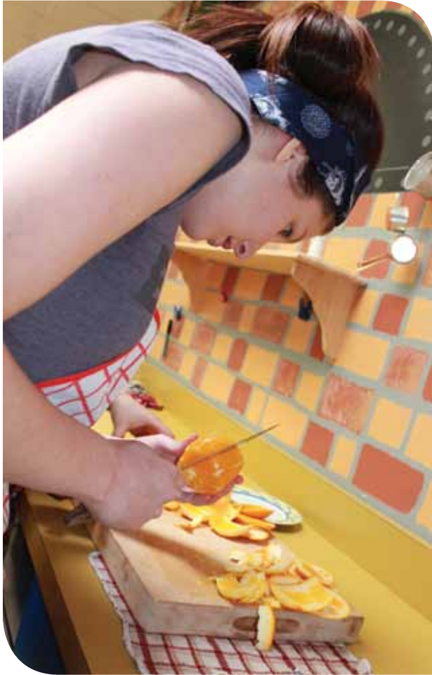
FRANCOPHONE NORD-EST SCHOOL DISTRICT

physical activity, mental fitness and resilience, healthy eating, and tobacco-free living. Mental fitness and resilience, in particular, are recognized as triggers of positive behavioural change in the direction of wellness. Mental fitness is now one of the central concerns of schools, from a perspective no longer confined to the problem itself, but which sees itself as more proactive and preventive. The school environment is replete with opportunities for generating self-esteem, resilience, and positive interpersonal relationships.