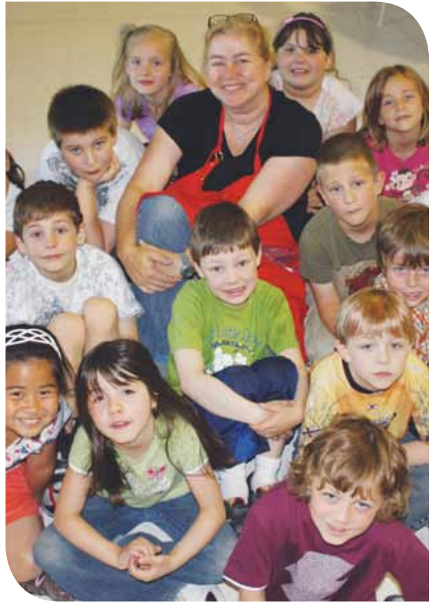
FRANCOPHONE NORD-EST SCHOOL DISTRICT

Urban areas also lend themselves to two other phenomena affecting the Francophone minority's resilience: immigration and exogamy. Newcomers choose primarily to settle in cities. However, as indicated earlier, only 13% of them have French as their first language. The social attraction of English is also very strong among Allophone newcomers outside Quebec