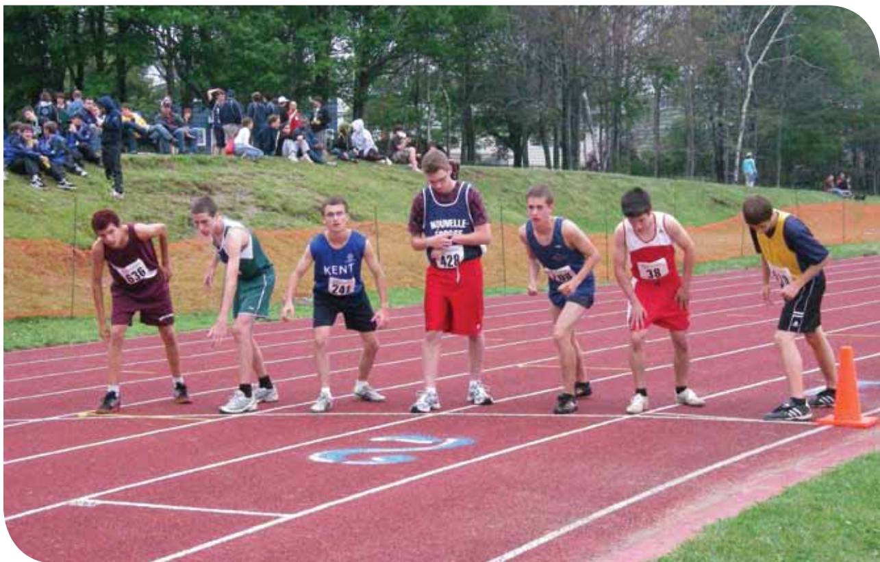
Jeux de l'Acadie.

primary goal of this interdepartmental, intersectoral and community collaboration will be to create conditions facilitating the transitions for students at each stage in their schooling, from early childhood to adulthood. By making an individual and collective commitment, these leaders will be able to decide what has to be done to bring the sectors together, and then identify and carry out the actions that will result in the achievement of the anticipated outcomes of the policy. This group should also work out a continuous improvement mechanism. Such a mechanism should, among other things, assess the impact and effectiveness of the actions in relation to the desired changes, in order to ensure that actions are always cohesive (see Vitality strategy V 5, page 58).