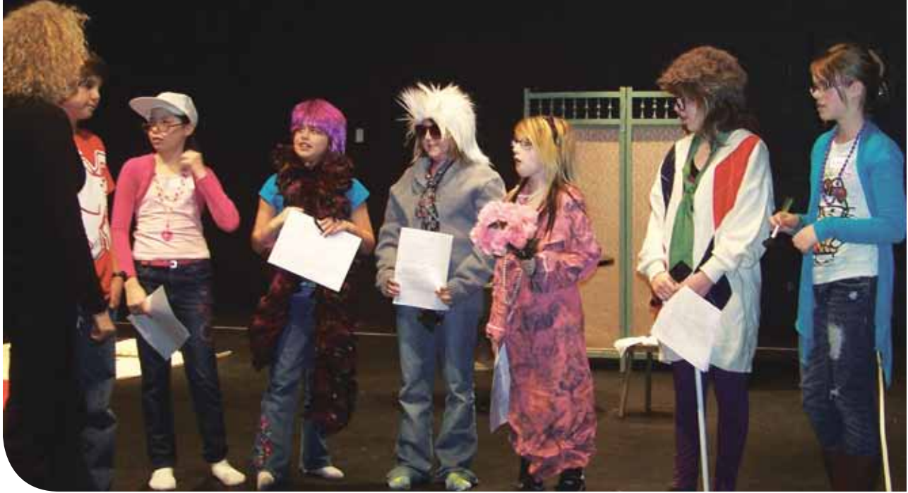
Festival de théâtre jeunesse en Acadie, Caraquet, N.B.

Lastly, the importance of promoting and showcasing the expertise in the Acadian and Francophone education system has to be reaffirmed. The achievements and innovations of its students, teaching staff, researchers, community partners, leaders and administrators deserve to be seen and known, both locally and internationally. By drawing attention to its impressive range of expertise, the education system will support not only its own vitality, but also that of the Acadian and Francophone community, its young people and New Brunswick society as a whole.