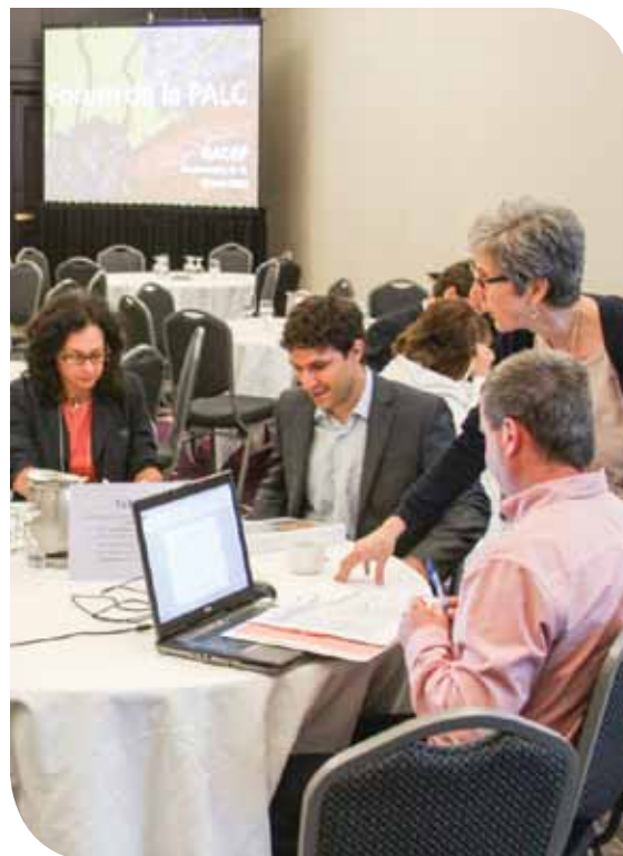
Workshop, LCDP Forum, Fredericton, N.B., June 2013.