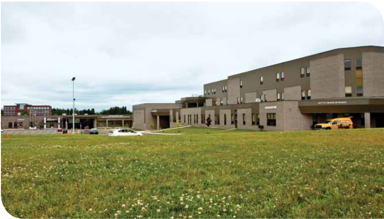
Centre communautaire Sainte-Anne in Fredericton, N.B., the first Francophone school-community centre in Canada.