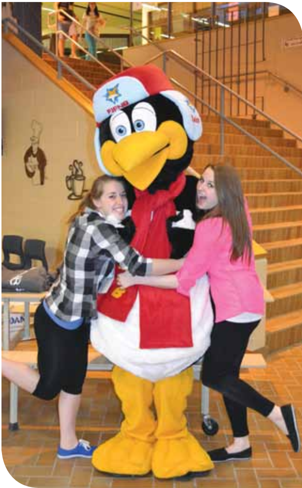
Zwick, mascot of the Fédération des jeunes francophones du Nouveau-Brunswick. (FJFNB).

Enhance the contribution, participation and visibility of Acadian and Francophone youth and the entire community in the traditional and digital media.