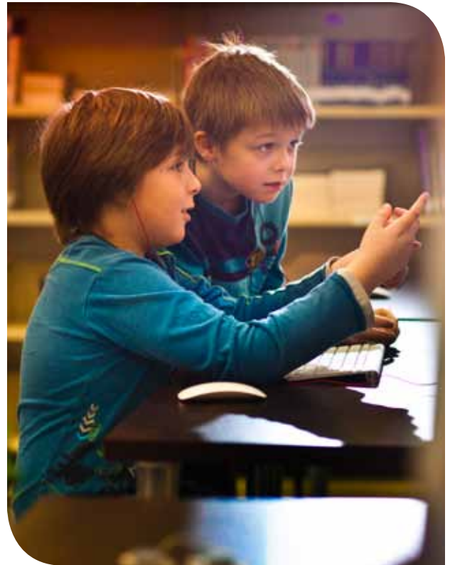
FRANCOPHONE NORD-OUEST SCHOOL DISTRICT.

The importance of training, partnership and collaboration is the backdrop for all the strategies in the Linguistic and Cultural Development Policy.