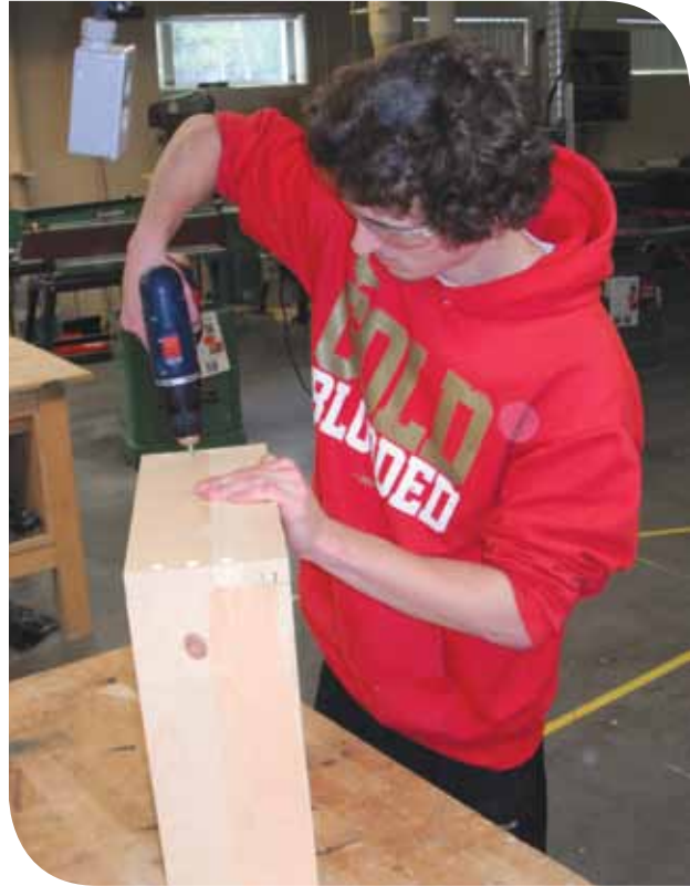
FRANCOPHONE SUD SCHOOL DISTRICT

Access to a variety of elective courses also contributes to the life/career development of students by giving them the opportunity to discover new passions and acquire knowledge and skills in various fields. Schools can profit from online courses to broaden the spectrum of offerings they make available to their students: this is one way of dealing with rurality, decline, lack of resources or scheduling conflicts. Directed to students in grades 10 to 12, and increasingly to those in grades 8 and 9, online courses are supported by differentiated instruction and can therefore accommodate students with special needs and different paces of learning.