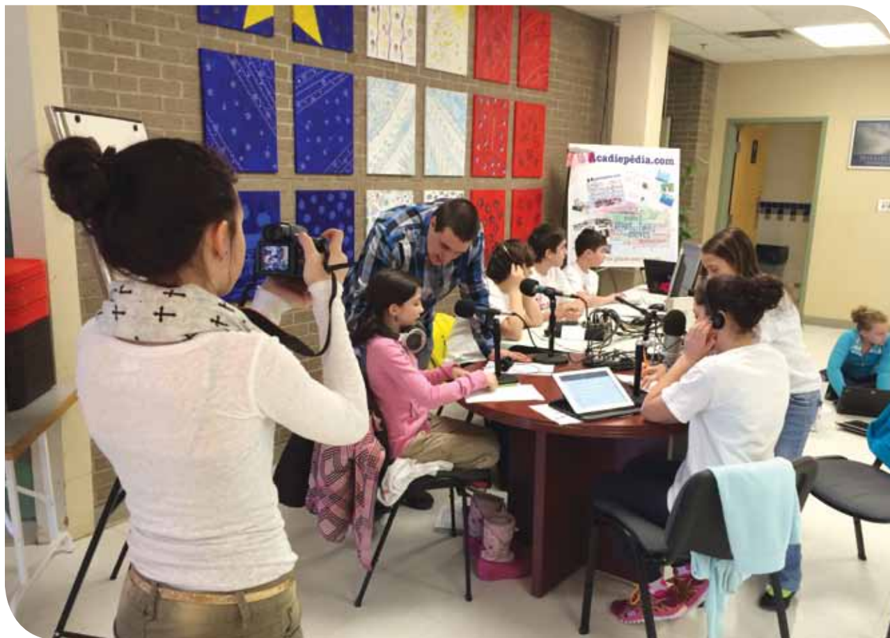
FRANCOPHONE NORD-OUEST SCHOOL DISTRICT

On another topic, it would seem essential to make all key players in the Acadian and Francophone community conscious of the importance of their role as conveyors of culture on the Web. Affirming and representing oneself in French in the virtual realm and on social networks definitely helps to build a positive image and contributes to the appropriation of the French language and culture. The more that young Acadians and Francophones encounter and recognize each other on the different media, the more they will value their culture, the more they will develop a positive relationship with the language, and the more they will tend to express themselves publicly in French. All of this will have positive impacts for the entire Acadian and Francophone community.