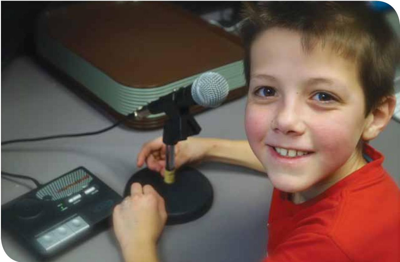
FRANCOPHONE NORD-OUEST SCHOOL DISTRICT

In addition, since expertise cannot always be drawn from the same community, it might be worthwhile to take greater advantage of the media and social networks to collaborate with professionals working outside the province, or even the country. Such extended cooperation would allow the key stakeholders of the Acadian and Francophone education system to broaden their horizons and become familiar with other successful approaches or best practices.