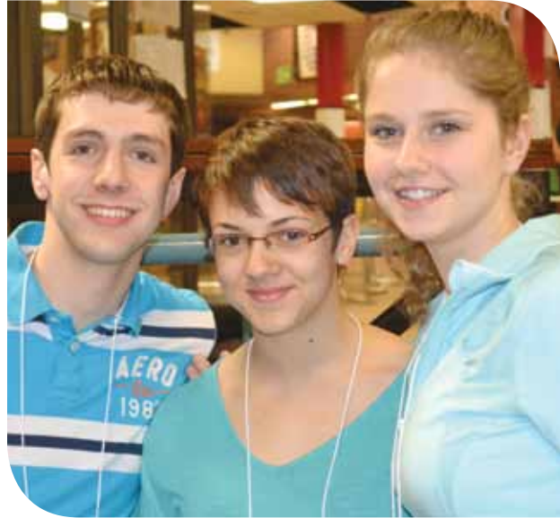
FJFNB youth rally.

All the partners in the education system are collectively committed to building the identity of all members of the Acadian and Francophone community.