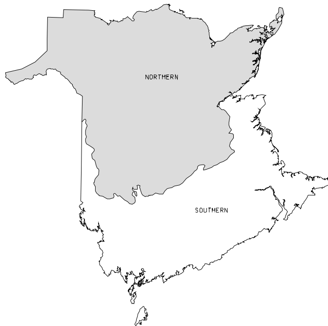
Figure 2. Management zones for deer winter habitat.